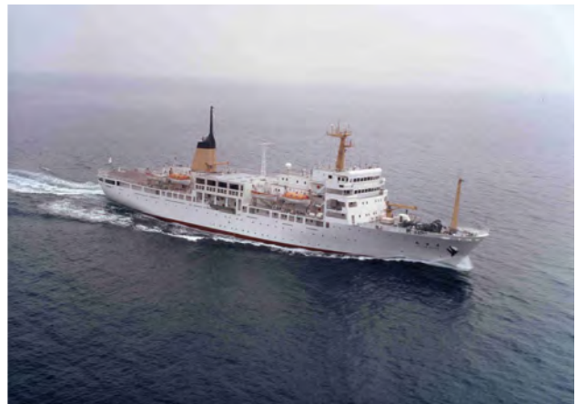
Seiun Maru, Training Ship National Institute for Sea Training

Planning & Produce: The Maritime Human Resource Institute, Japan