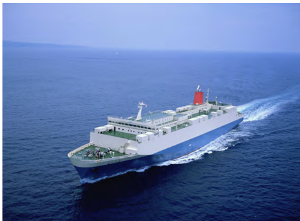
Musashi Maru, Ro-Ro Ship MOL Ferry Co., Ltd.

We hereby acknowledge the members of the ERM expert committee for their contribution and the cooperation for shootings extended by all the personnel on board Musashi Maru, a Ro-Ro ship of MOL Ferry Corporation Limited and Seiun Maru, a Training Ship of National Institute for Sea Training, Independent Administrative Institution, Japan in producing this DVD.